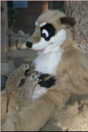
Kendi and Rafiki enjoy treats from their new friend

It was a special day full of laughter and delight!