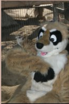
Rafiki gets cozy with his new buddy