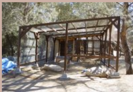
One of our newest enclosures under construction